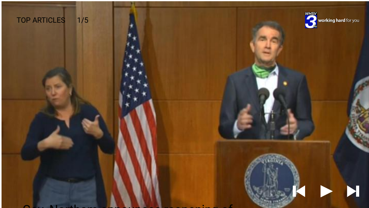
Gov. Northam announces reopening of Virginia Beach, new taskforce on school plans